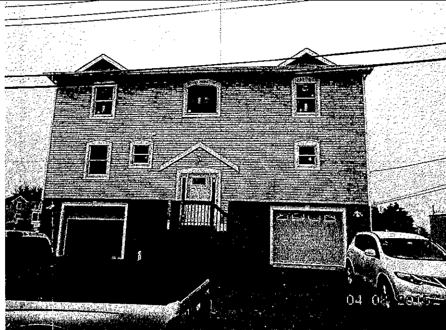
Front View Taken 4/8/15

If submitting more photographs than will fit on the preceding page, affix the additional photographs below. Identify all photographs with: date taken; "Front View" and "Rear View"; and, if required, "Right Side View" and "Left Side View." When applicable, photographs must show the foundation with representative examples of the flood openings or vents, as indicated in Section A8.